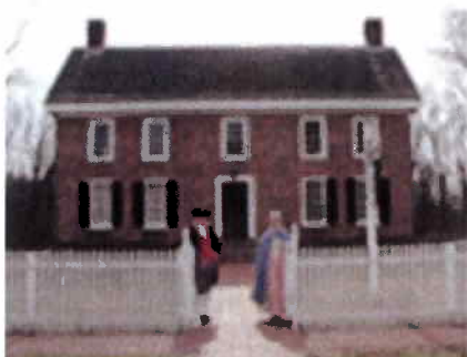
Old Dutch Parsonage