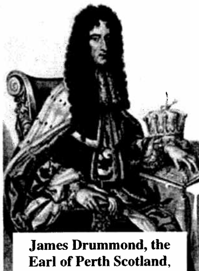
James Drummond, the Earl of Perth Scotland,