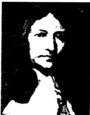
Sir George Carteret

In March 1664, Stuart King Charles II of England gave to his brother James, the Duke of York (later King James II) all of Dutch-occupied New Jersey. With lavish generosity the Duke of York granted what is now New Jersey to John, Lord Berkeley and Sir George Carteret on June 23, 1664. These two Proprietors had served the royal cause of Restoration in England during the trying years of the Civil War and the Commonwealth. The Duke bestowed the name Nova Caesarea or New Jersey in sentimental gratitude because Carteret had stoutly defended the Isle of Jersey in the English Channel for the Royalists in the English Civil War, in 1649, that had temporarily unseated the Stuarts in the 1640s.