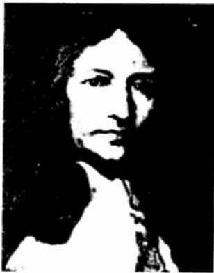
Sir George Carteret

In March 1664, Stuart King Charles II of England gave to his brother James, the Duke of York (later King James II) all of Dutch-occupied New Jersey. With lavish generosity the Duke of York granted what is now New Jersey to John, Lord Berkeley and Sir George Carteret on June 23, 1664. These two Proprietors had served the royal cause of Restoration in England during the trying years of the Civil War and the Commonwealth. The Duke bestowed the name Nova Caesarea or New Jersey in sentimental gratitude because Carteret had stoutly defended the Isle of Jersey in the English Channel for the Royalists in the English Civil War, in 1649, that had temporarily unseated the Stuarts in the 1640s.