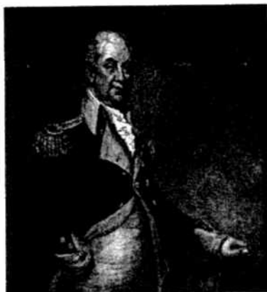
General Henry Knox