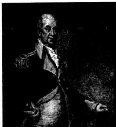
General Henry Knox