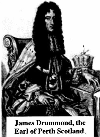
James Drummond, the Earl of Perth, Scotland,